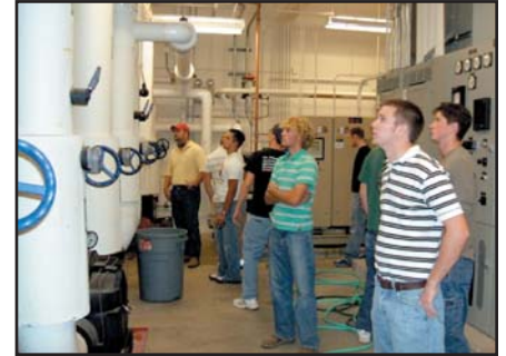
Students view the mechanical systems at the Henry Doorly Zoo's heating and chilling plant.

Volunteering is not our only activity this year. We have also taken many informative tours.